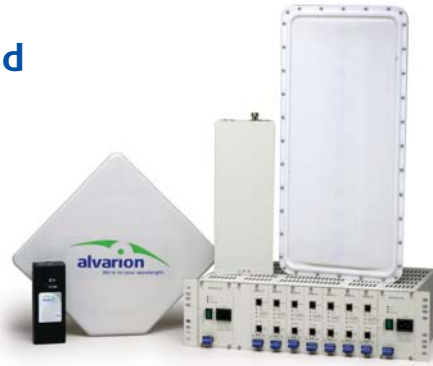
BreezeACCESS VL Family

Alvarion brings to the world of wireless broadband its new Version 4.0 for BreezeACCESS VL in the entire 5GHz band and for BreezeACCESS 4900. With new end-to-end quality of service (QoS) algorithms and other enhancements, operators are now able to offer scaled toll-quality voice and video. Version 4.0 also introduces new security features required for homeland security applications, private networks, and businesses.