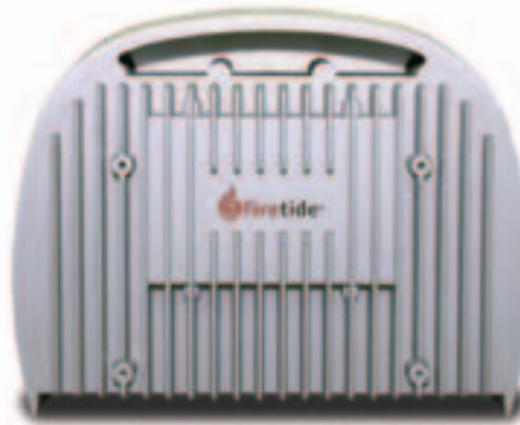
Firetide HotPort outdoor mesh node

jitter-free images at high frame rates, and because the Firetide mesh is not an open network, it doesn't have any of the security concerns associated with Wi-Fi networks.