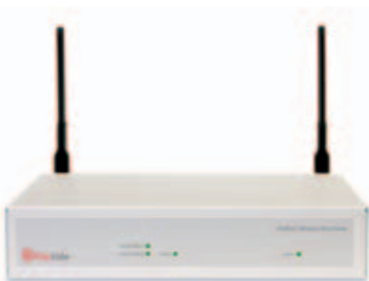
Firetide HotPort indoor mesh node

The best solution is a Firetide multi-service wireless mesh network. The Firetide mesh provides standard Ethernet ports on every wireless node, so virtually any enterprise grade IP camera can connect to the wireless mesh network. This capability means many more camera choices are available, and it also allows the seamless extension of networks that may already be in place. The Firetide mesh provides substantial bandwidth capable of supporting many simultaneous video streams. Traffic prioritization ensures smooth,