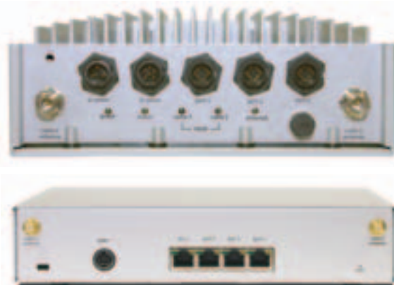
Firetide Hotport mesh nodes provide Ethernet ports so IP cameras and wired Ethernet devices can operate on a wireless mesh network. Outdoor mesh nodes utilize weatherproof connectors.

HotPort mesh nodes provide up to 70 Mbps throughput and operate at 2.4 GHz, 4.9 GHz (U.S. public safety licensed band), or 5 GHz. Depending on the model, HotPort nodes are equipped with either single or dual radios, operating at 400 mW.