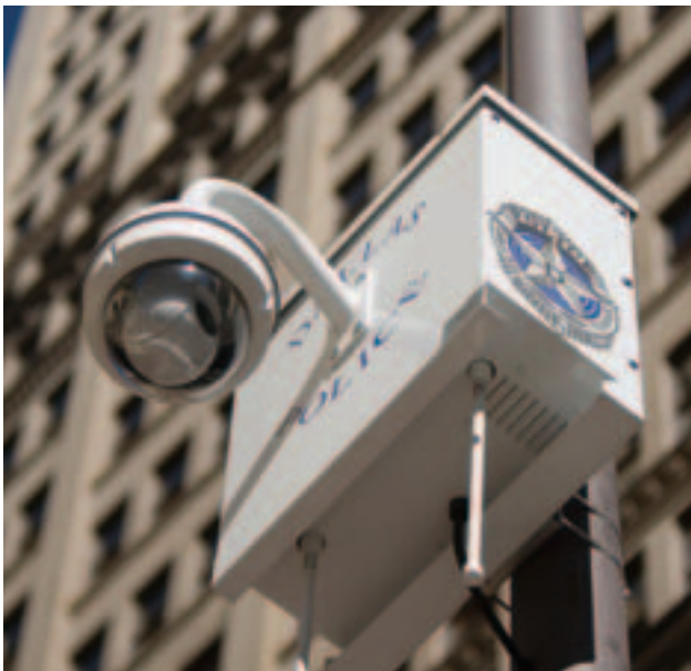
Custom-built enclosure with Firetide mesh node inside

Parking garages, bus stops, airports, and train stations as well as shipyards and freight areas are prime locations for expanded surveillance. However trenching and installation for cables to connect video cameras from these sites can be cost-prohibitive and limited to only those spots where cable can actually reach. Because they provide a wireless backbone, HotPort mesh nodes now enable camera installation anywhere, indoors or outdoors, on light poles, antennas, ticket booths, and billboards to increase network reach and monitoring effectiveness.