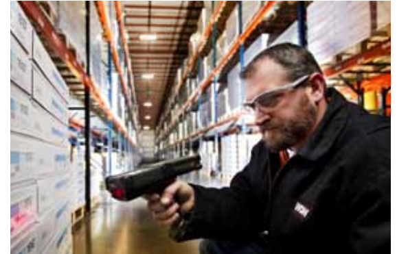
WOW needed a stronger Wi-Fi network that could deliver better service to 98 Wi-Fi-enabled Motorola bar code scanners and 40 badges used for inventory management.

WOW settled on four vendors to bid on the project: Motorola, Cisco, Aruba, and Ruckus Wireless.