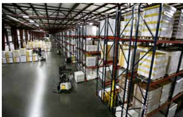
WOW's ever-changing warehouses with solid steel racks is filled with millions of pounds of cheese and paper created untenable RF issues.

WOW material handlers, forklift drivers, and truck loaders depend on Wi-Fi to make their warehouse processes more efficient by gaining universal access to real-time inventory information and eliminating counting and picking errors. The devices are used for a variety of purposes such as scanning pallet and product locations, clocking hours, tracking product movements, tow motor inspection, trailer inspections, driver signatures, calendar entries, and MSDS tracking.